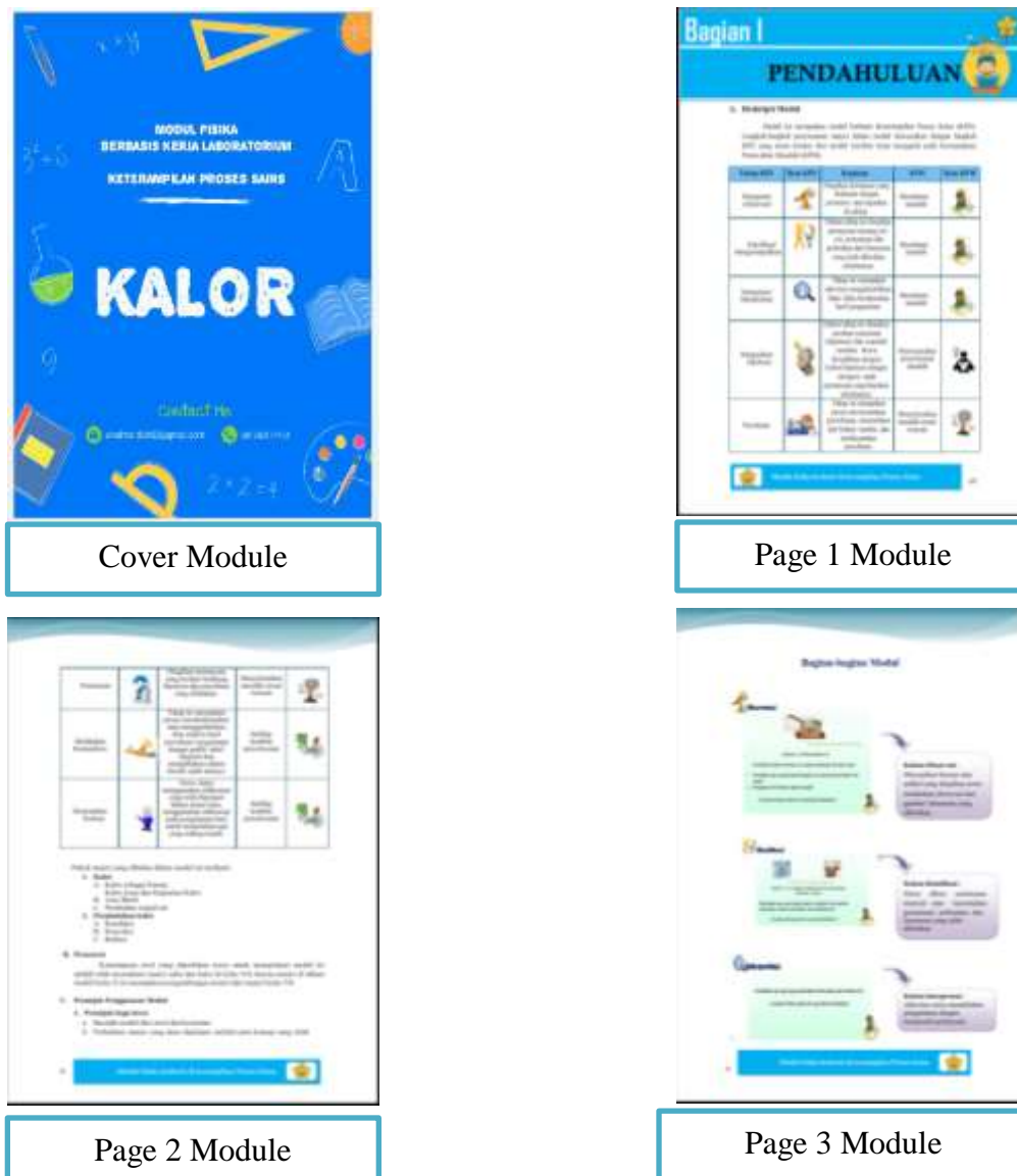
Figure 2. Display of the Module Design that has been developed