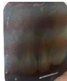
June 30 th 2011