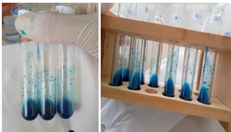
Figure 1. A change in the color of the solution to blue indicated positive results for all samples

The malachite green solution competes with Hb to bind oxygen because Hb has a higher affinity than malachite green so Hb will bind oxygen first. Imperfect bleeding can be seen when the mixed solution of meat extract, H 2 O 2 3%, and malachite green turns green and cloudy, while the positive result (perfect bleeding) occurs if the solution is clear blue (Sulasmi, 2012) (Figures 1 and 2).