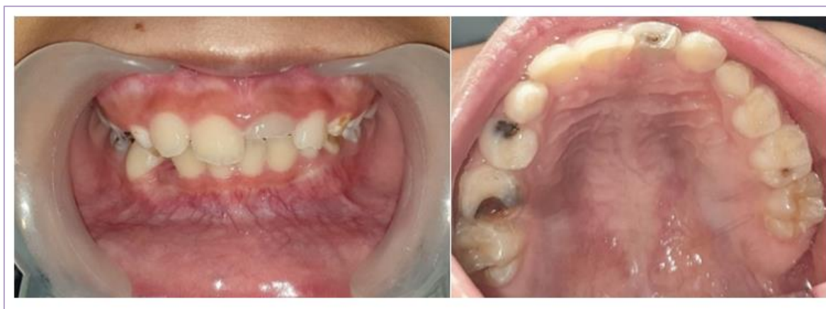
Figure 1. Preoperative of Intra-Oral

An eight-year-old male patient and his parent visited the clinic and asked for treatment for his broken upper left front teeth due to an accident while cycling one month ago. When falling one month ago, he felt pain in his teeth and bled, and the pain was gone after taking paracetamol for three days. The patient visited the clinic to have a dental treatment. The objective extra- and intraoral examinations were performed, and the extraoral clinical examination found no abnormality. Intraoral clinical examination showed a fracture expand from the enamel to the pulp space on the upper left central incisor (21- WHO classification).