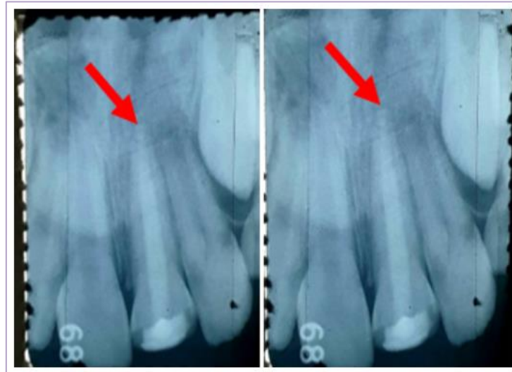
Figure 4. \text{Ca(OH)}_2 Application

Barrier calcification closure evaluation was formed one month after \text{Ca(OH)}_2 application through periapical x-ray and clinical assessment. However, the root canal dressing was continued to complete the barrier calcification formation. Hence, \text{Ca(OH)}_2 paste was removed from the root canal by irrigating the root canal with 1,25 % sodium hypochlorite and saline. Then, \text{Ca(OH)}_2 paste was reinserted according to the working length. The evaluation was made three months later (Fig 5A). After three months, the assessment was performed by taking a periapical x-ray and using a small Niti Kfile #8 to sense the apical stop of the previously immature tooth. The presence of an apical stop indicates a complete barrier calcification. The periapical image also clearly showed that the apical edge of the tooth has been closed and looks rounder compared to the pre-treatment condition (Fig 5B). After barrier calcification was formed, the treatment was continued by gutta-percha radiograph trial according to the working length. Then, the root canal is filled by gutta-percha and the resin-based sealer permanently by lateral condensing method due to a wide root canal and filled by glass ionomer cement restoration (Fig 5C).