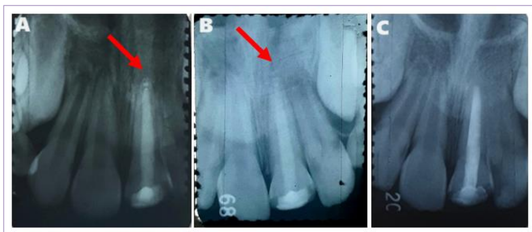
Figure 5. (A) 1-month after \text{Ca(OH)}_2 Application, (B) 3 months after \text{Ca(OH)}_2 Application, (C) Root canal filling with resin-based sealer and gutta-percha

Barrier calcification closure evaluation was formed one month after \text{Ca(OH)}_2 application through periapical x-ray and clinical assessment. However, the root canal dressing was continued to complete the barrier calcification formation. Hence, \text{Ca(OH)}_2 paste was removed from the root canal by irrigating the root canal with 1,25 % sodium hypochlorite and saline. Then, \text{Ca(OH)}_2 paste was reinserted according to the working length. The evaluation was made three months later (Fig 5A). After three months, the assessment was performed by taking a periapical x-ray and using a small Niti Kfile #8 to sense the apical stop of the previously immature tooth. The presence of an apical stop indicates a complete barrier calcification. The periapical image also clearly showed that the apical edge of the tooth has been closed and looks rounder compared to the pre-treatment condition (Fig 5B). After barrier calcification was formed, the treatment was continued by gutta-percha radiograph trial according to the working length. Then, the root canal is filled by gutta-percha and the resin-based sealer permanently by lateral condensing method due to a wide root canal and filled by glass ionomer cement restoration (Fig 5C).