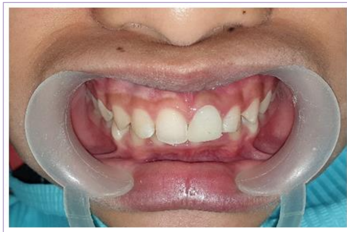
Figure 6. Acrylic crown

The provisional acrylic crown was selected for restoration one week after the clinical evaluation of root canal filling. In this case, the patient is determined without post-placement because the patient is still in the dentoalveolar developmental phase (growing phase) to avoid recurrent adjustment. The crown material was lightweight to avoid excessive weight for the rest of the tissue, preventing the rest of the tissue from being fractured until the patient reached an optimal age for further complex restoration. An acrylic crown is also chosen for its low-cost treatment.